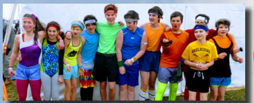
Background Photo by Graham Byers '18