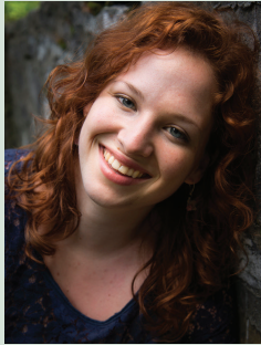
Julia Lockett Cox '08 Skidmore, BS Julia Lockett Photography www.julialockett.com

I specialize in portraiture, drawing on the experiences of the subject to create the photograph. I strive to create beautiful images that reveal something personal.