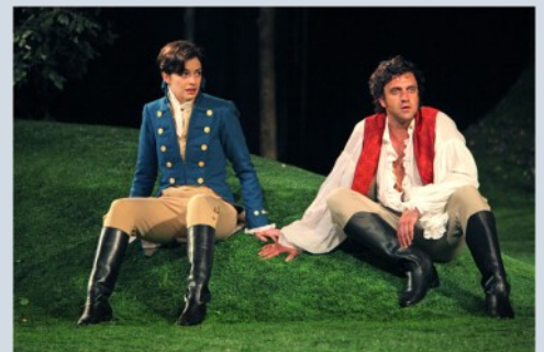
The costume look we are going for

Thanks very much in advance! On behalf of the cast, we look forward to seeing you on April 5th and 6th at 7 pm at Contois Auditorium, located in City Hall on Church Street!