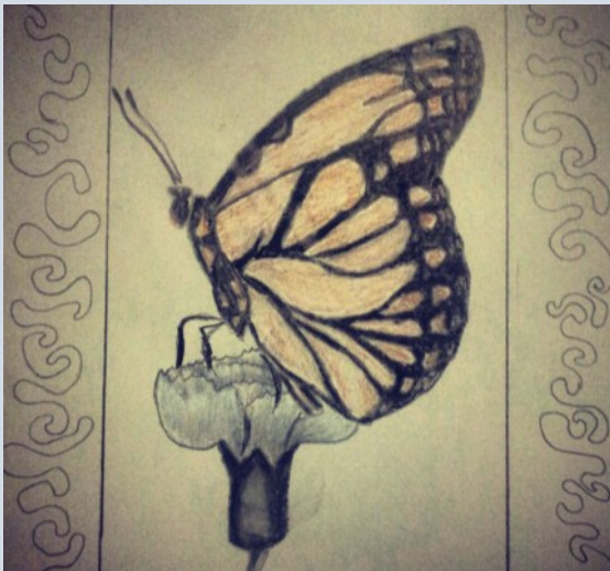
Sketch by Auburn Sendra, '16